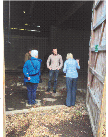
Committee members viewing the barn

outbuildings, but none is currently in use. The lovely cottage has a secure tenant, and is not under threat, according to both Oxford City Council and the Oxfordshire Preservation Trust (which has a restrictive covenant over the depot). There is no suggestion of substantial development for, say, student housing. The City Council has commissioned architects to undertake a feasibility study about possible development of the site for community/commercial use, and Friends of South Park will be consulted about their recommendations.